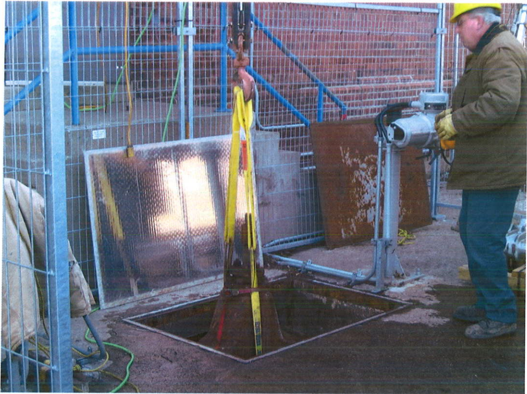
Initial removal of Chapman 36" cast Iron gate valve