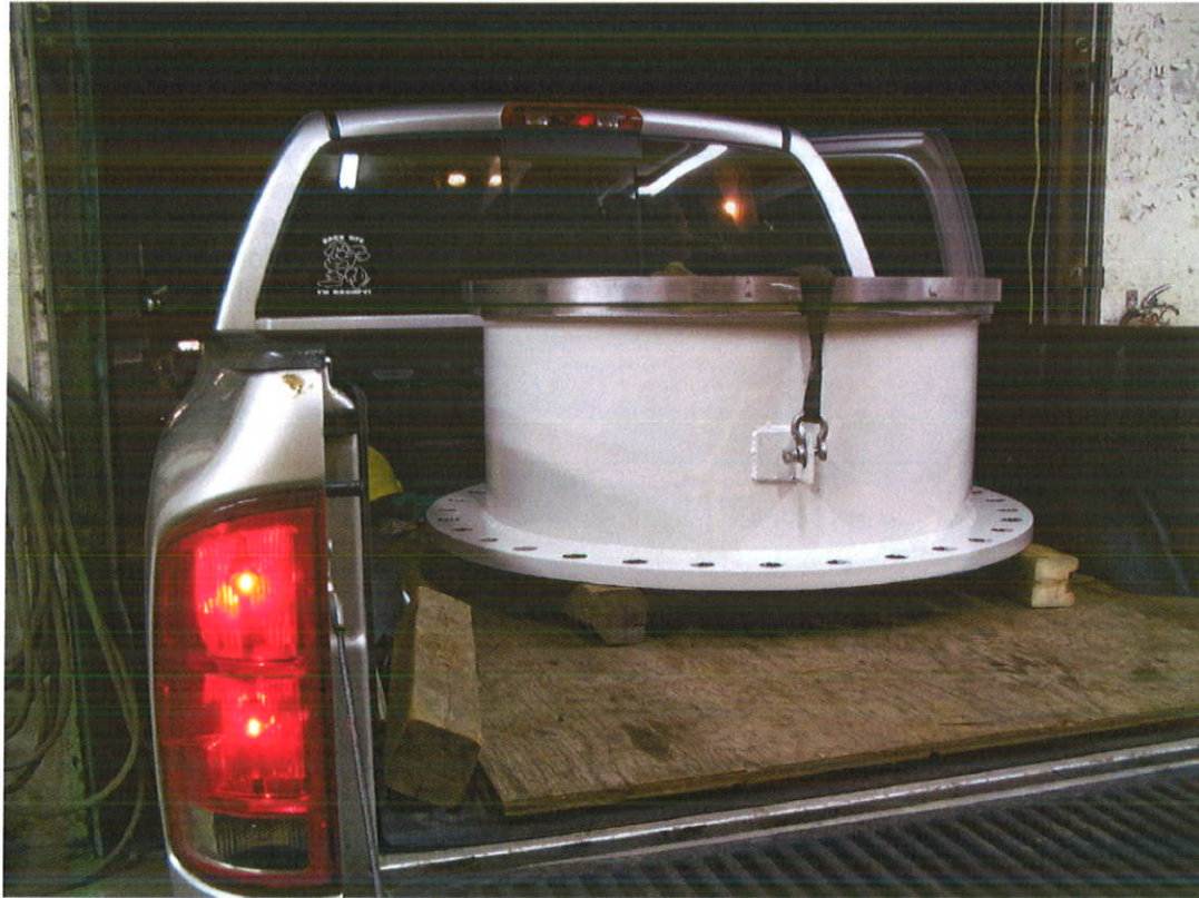
The new spool section has been built with one flange end and the other to suit an existing Victaulic coupling.